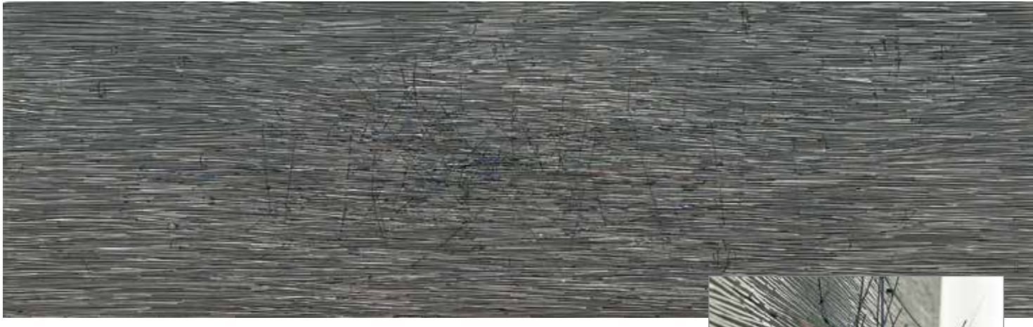
Jesús Rafaél Soto. Vibration, 1960. Painted wire on painted wood. 23 <sup>5</sup>/<sub>8</sub> x 78 <sup>3</sup>/<sub>4</sub> x 7 in. (60 x 200 x 17.7 cm).*