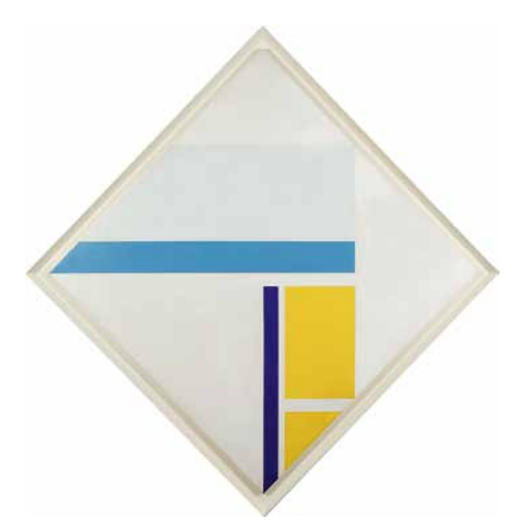
Burgoyne Diller. Untitled, c.1940. Paper collage on board. 21 x 21 in. (53.3 x 53.3 cm).*