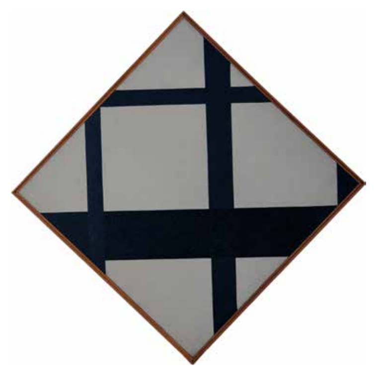
Carlos Rojas. V2, V4, from Vision Engineering, 1969 – 1970. Mixed media. 31 ½ x 31 ½ in. (80 x 80 cm).*